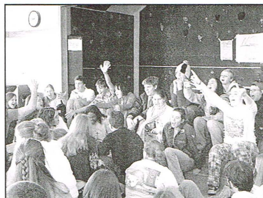
PALs in action.