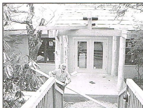
The new ramp leading to the new Dining Hall entrance.