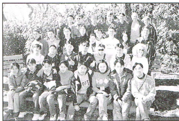
The group kicked off their American visit with a successful weekend at The Mountain.