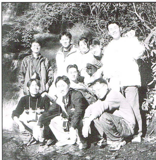
Visiting local waterfalls.