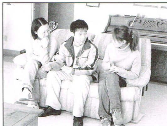
Enjoying free time in the Lower Rec Hall.