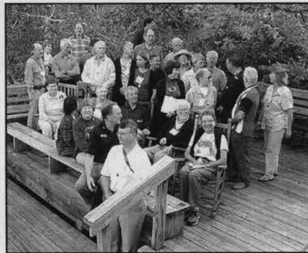
The President's Society gathered at Memorial Day Weekend.