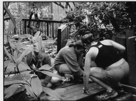
Dallas YRUU experience service at The Mountain.

This summer youth from the First UU Church of Dallas, Mountain volunteers and staff built a