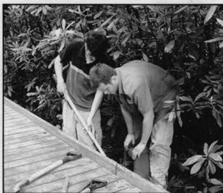
Dallas youth building the newest accessible ramp.

of their many “apprenticeship activities,” – kitchen, office, program, maintenance and construction duties – helped create the environment of youth empowerment and responsibility that is so central to The Mountain experience.