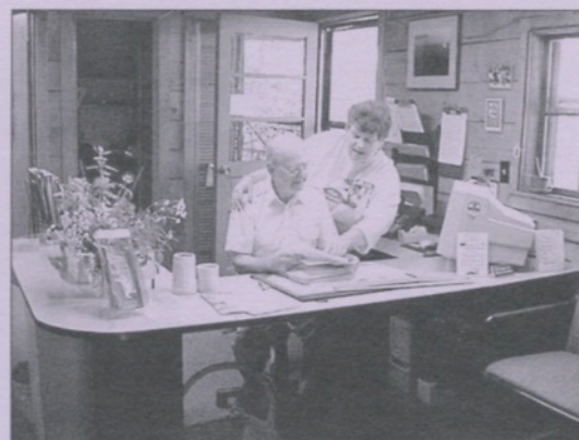
Mountain staff are ready to greet you!

Please indicate your preference between double occupancy housing and multiple occupancy housing. Multiple occupancy is defined as 3 or more adults sharing a bathroom. There is a per night surcharge for private rooms when requested. Private rooms are dependent upon availability. Full payment of program fees is due at time of registration. Early bird discount rates are valid until the dates indicated in the fee table. Registration must be received by The Mountain by the early bird deadline to qualify. When full payment for your registration is received, you will receive a confirmation packet that includes your housing assignment.