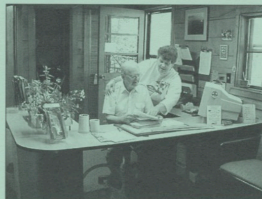
Mountain staff are ready to greet you!

Full payment of program fees is due at time of registration. Early bird discount rates are valid until the dates indicated in the fee table. Registration must be received by The Mountain by the early bird deadline to qualify. When full payment for your registration is received, you will receive a confirmation packet that includes your housing assignment.