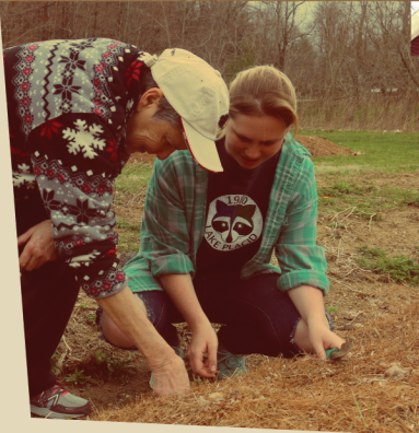
Planting the seeds of change

Our youth CONferences are intentionally designed to supplement and affirm UU religious educational programs and lifespan faith development objectives.